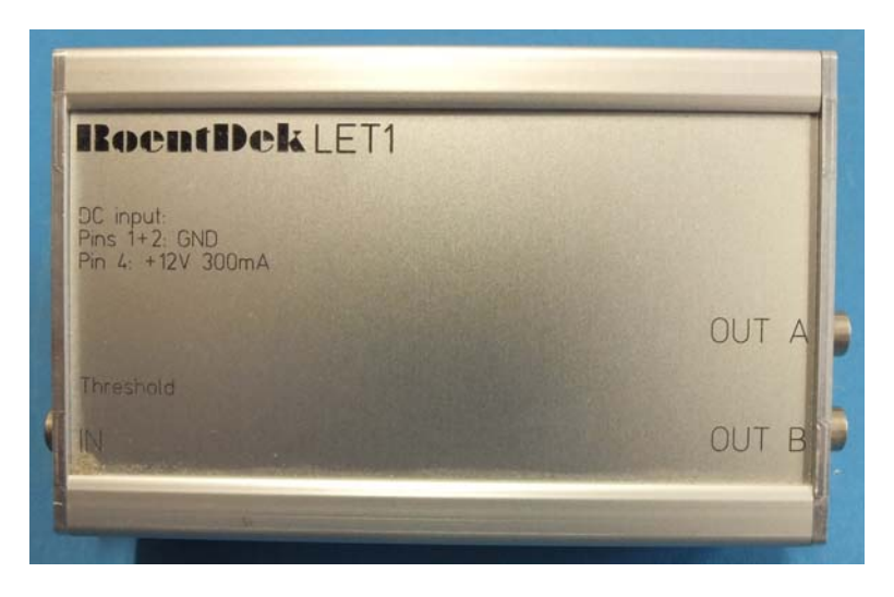
Figure: LET1 module. The LET1+version is similar but biased via an USB socket.

Signal rise time (typically 1 to 5 ns FWHM temporal resolution when used with a IROENTIDEK DET detector). The ToT can give information about the input pulse height.