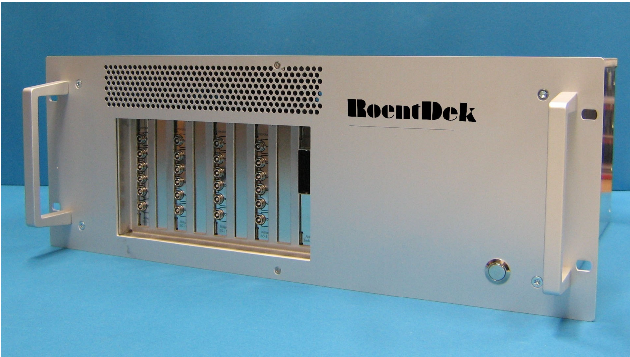
Figure 2: the PCIe-extension crate can house up to 8 RoentDek fADC4 modules (4 fADC4 are displayed in this picture). An alternative version linking up to 5 fADC4 and up to 2 TDC8HP is in development

Up to 8 fADC4 modules can be used in combination as one synchronized instrument. The driver also allows for a seamless synchronization with our 8 channel TDCs (www link: TDC8HP ). If not enough PCIe slots are available inside the PC then a crate solution can be used.