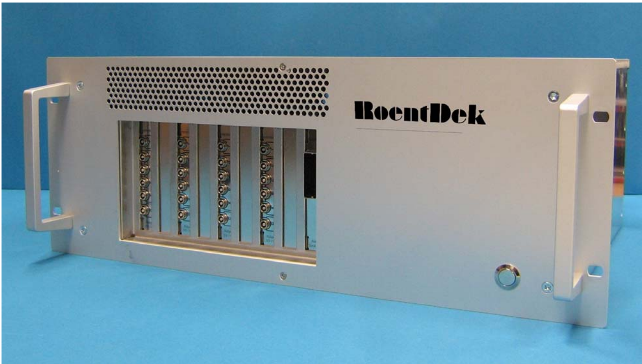
Figure 2: the PCIe-extension crate can house up to 8 RoentDek fADC4 modules (4 fADC4 are displayed in this picture). An alternative version linking up to 5 fADC4 and up to 2 TDC8HP is in development

Up to 8 fADC4 modules can be used in combination as one synchronized instrument. The driver also allows for a seamless synchronization with our 8 channel TDCs (www link: TDC8HP ). If not enough PCIe slots are available inside the PC then a crate solution can be used.