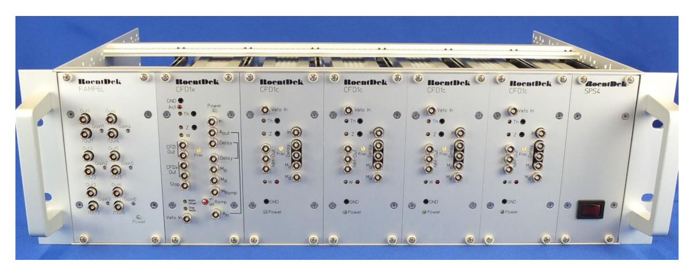
Figure 1: FEE5x with 19" 3HU crate hosting six amplifier channels (FAM6L or two FAMP3) and 4+1 CFD channels (four CFD1c plus one CFD1x). The CFD1x has additional circuits to transform pulse height information into a time delay for recording by a TDC channel. Below: version FEE5 with CFD4L (replacing four CFD1c) and standard CFD1c (can also be upgraded to FEE5x). RoentDek can also provide a FAMP6 and CFD4c as NIM cassette units and a frame for CFD1c/CFD1x for mounting in a NIM bin (not included). For cabling please refer to the FEE5 connection scheme.

Combinations between FAMP and CFD modules form the RoentDek FEE product family FEE2(x)/FEE5(x) for DLD and FEE8/FEE7x for delay-line detectors with Hexanode .