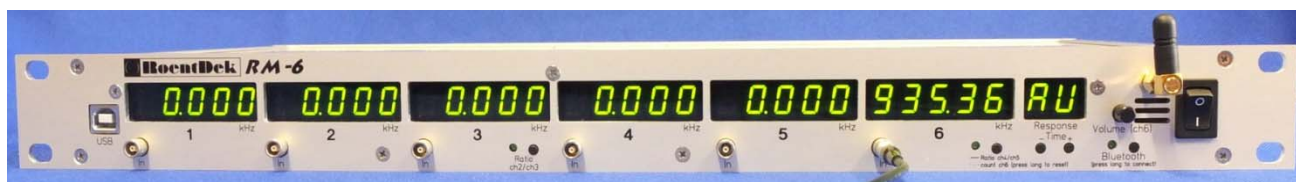
Figure 1: RM-6 counter module. Several displays allow simultaneous observation of up to six count rates.

The RoentDek RM-6 is a six-channel 100 MHz counter/rate-meter for logic signals (default: NIM, on 50 Ohm impedance lemo00 input socket) with a variety of display and computing options. The counter memories can be read-out via USB and blue-tooth allowing full control for analysing the data stream on the inputs by software (a small GUI-interface or via our software CoboldPC or LabView ).